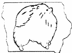
POMERANIAN CLUB OF GREATER DES MOINES, INC.

AKC NATIONAL OWNER - HANDLER SERIES- ALL SHOWS