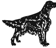
THE EASTERN IRISH SETTER ASSOCIATION, INC.