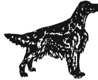
THE EASTERN IRISH SETTER ASSOCIATION, INC.

EASTERN IRISH SETTER ASSOCIATION AFTERNOON SPECIALTY